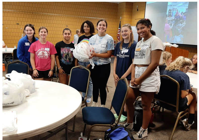
Our freshman making PLARN which is used to knit re-purposed plastic shopping bags into sleeping mats for those in need.