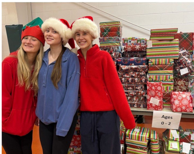
Stage 3: The "elves" passing out the wrapped toys