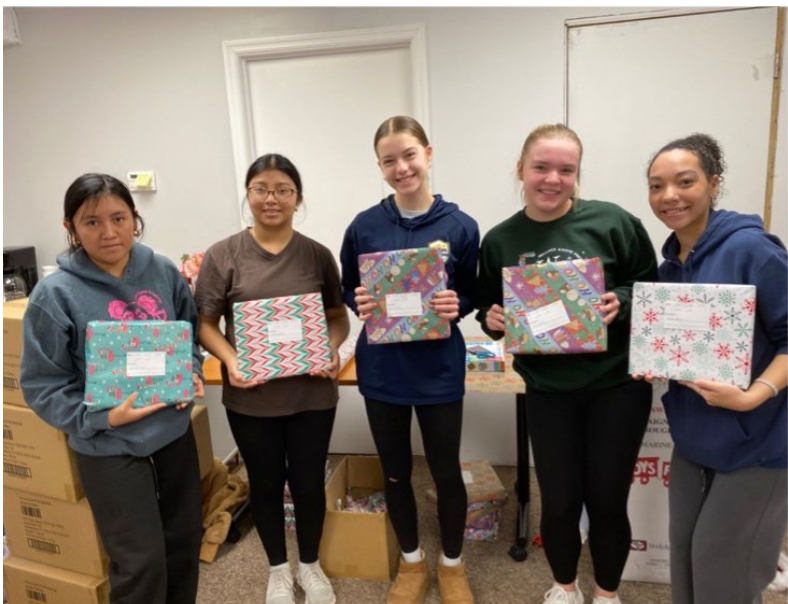
Stage 2: wrapping of the gifts

Spanish students began on October 9 visiting FiestaNKY who had received about 1000 toys to give to needy children for Christmas. The toys were stored in one small closet. So about 10 students arranged the toys into age groups and gender. After that was completed, on November 8, students joined with the AP Spanish Highlands HS class and volunteers from St. Henry to wrap all the presents. Donuts and traditional Hispanic hot chocolate made the time go faster. It was also a rewarding experience to collaborate with other schools with a noncompetitive but charitable goal in mind. Finally, on December 6, about 13 students handed out the gifts to excited little ones. It was truly a unique experience in which we could begin a project and follow it through each month. It was an appropriate preparation for the great feast of Christmas.