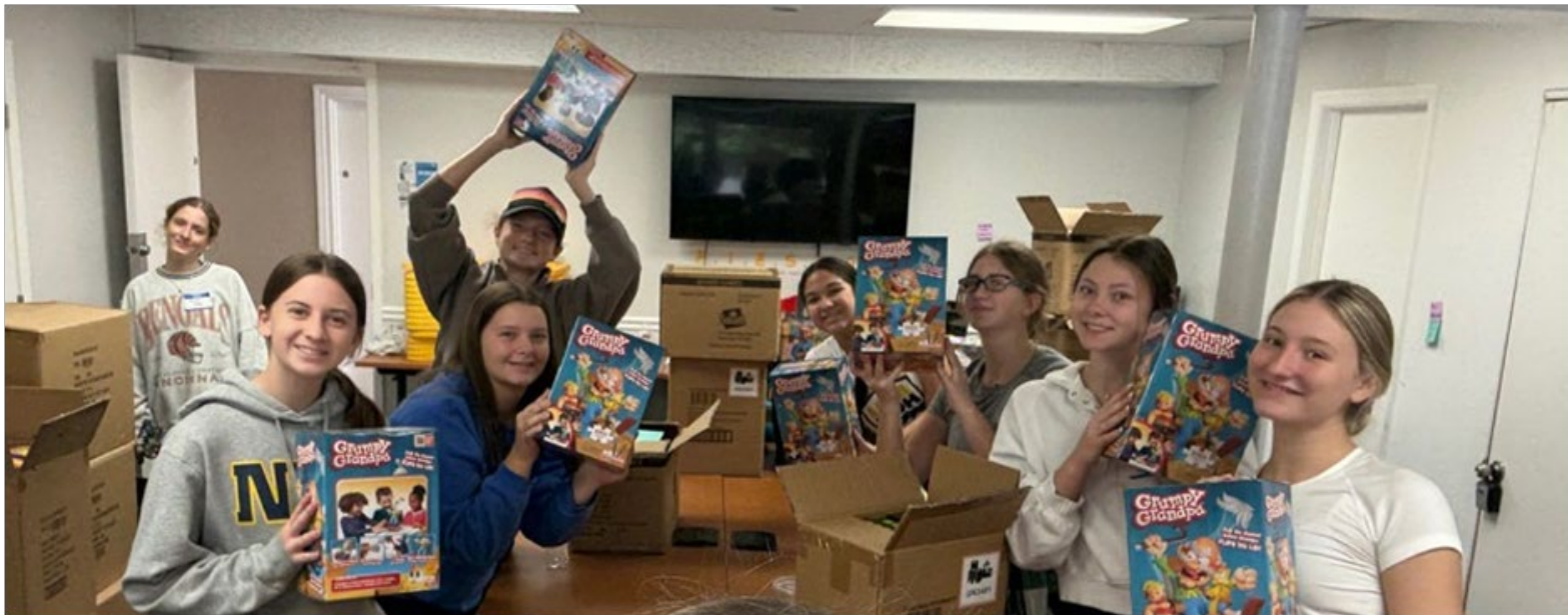
Pictured above: stage one, the separation process