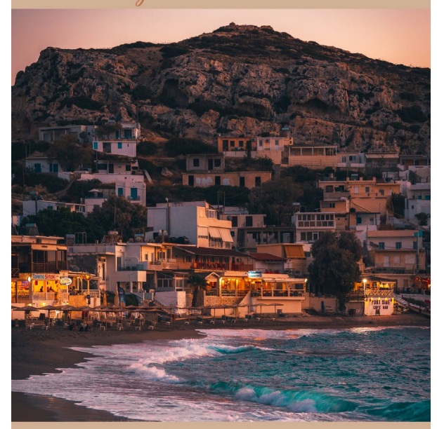
Give the gift of travel this year and come to our Travel Night December 14th at 6PM in the auditorium for all the information! <u>A Parent RSVP is mandatory to attend using this link: https://rsvp.eftours.com/kvb6n5u</u>