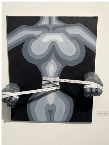
- Sammie Flowers