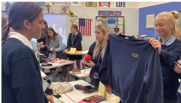
It can be difficult to make the final decision.