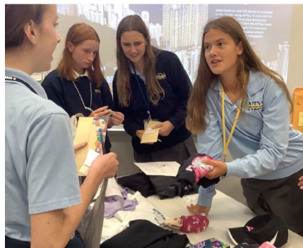
Customers and sellers trying to bargain for the best price