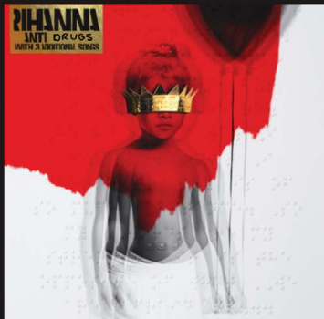
Rihanna Anti Deluxe Album Cover

STUDENTS, PARENTS, AND STAFF PLEASE COME TO LEARN ABOUT HOW DRUGS EFFECT YOUR BRAIN