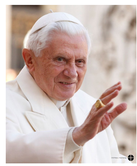
Pope Emeritus Benedict XVI April 16, 1927 - December 31, 2022