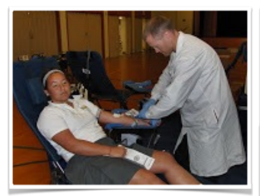
The Notre Dame Academy community donated 28 units at the school blood drive organized by the Hoxworth Blood Center of the University of Cincinnati. Hoxworth says 13 percent of its annual collections come from high schools.