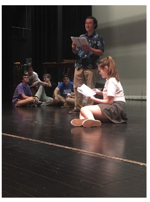
The Antigone cast reads through lines during a Tech Week practice.

Overall, tech week is bearable because of the people you are around. The camaraderie and friendships make hard work not so hard, and the show that much better.