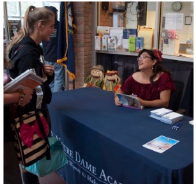
Common Reader Day: Reyna Grande, author of The Distance Between Us , signs autographs.